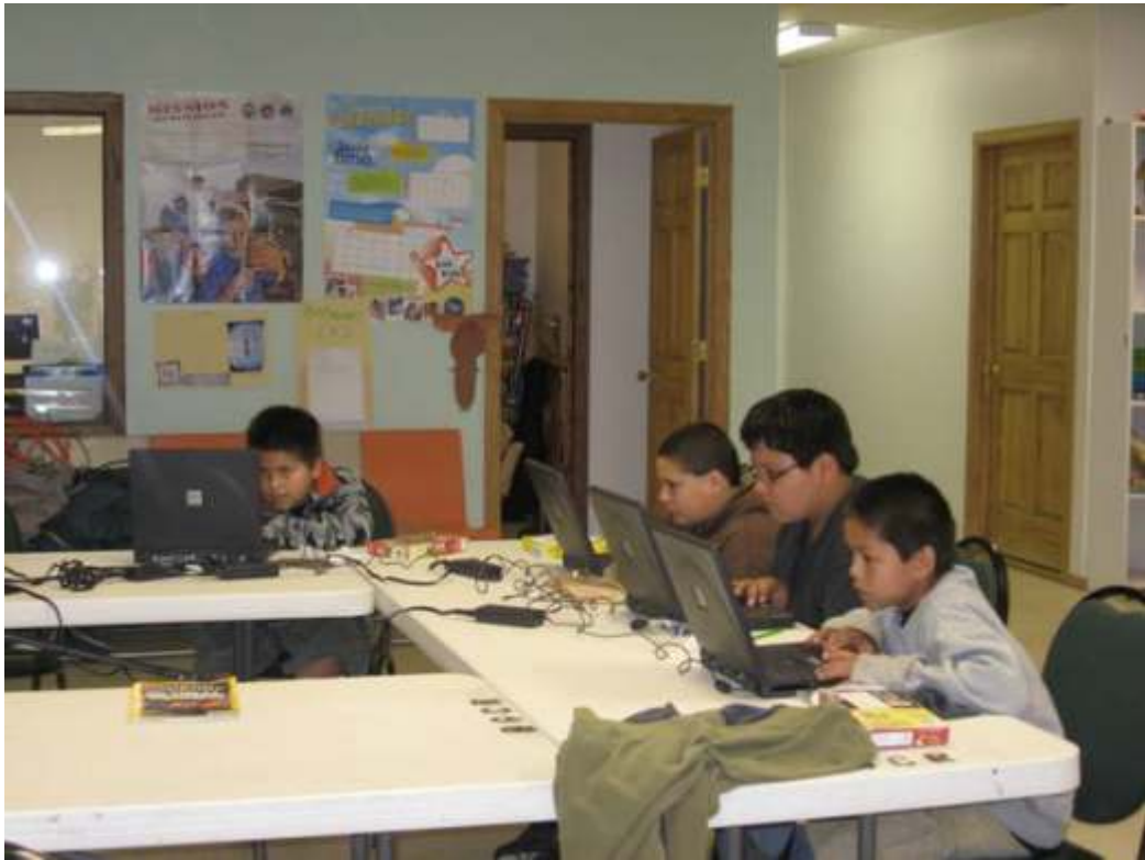
Kids on the South Dakota reservation use computers supplied by PC ReNew