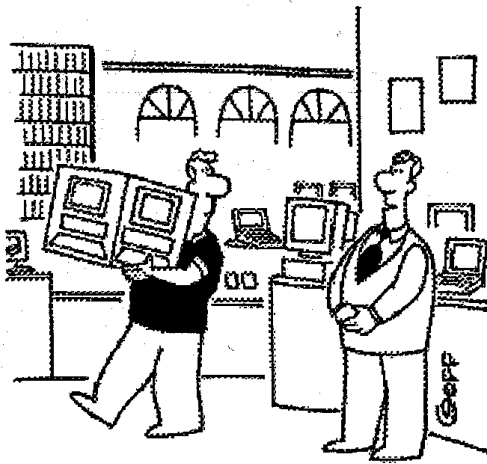
Before you leave the store, could I interest you in an upgrade?

Enjoy and take heed!!! The Virus Alerts keep multiplying!!!!